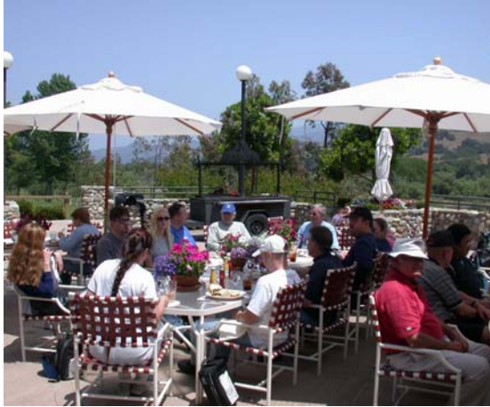
The "Wet" Hot Riders enjoy lunch and sunshine at the River Grill Restaurant in sunny Solvang.