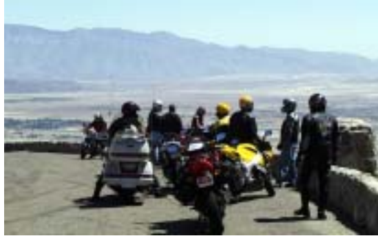
One group of riders stops at a turnout on Montezuma Highway. You can see Borrego Springs on the left and center. What a view and 76 degrees F! Who says you can't have your cake and eat it too?